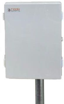
ENC-PL-15x11x6 Polycarbonate Enclosure