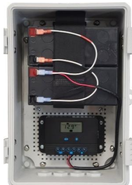
20A PWM Controller Inside